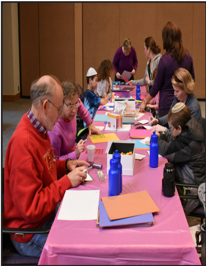
Crafts at K.I.