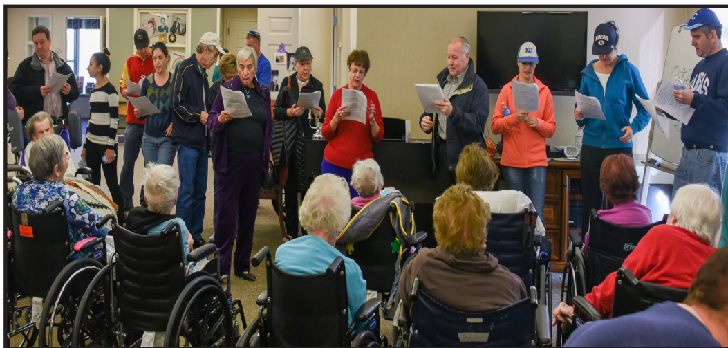
K.I. members singing to Village Shalom residents.