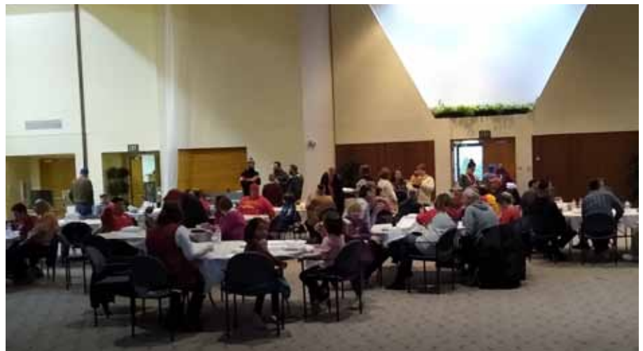
More than 100 people attended the Tailgate at the Shul to watch the football game between the Chiefs versus the Patriots.