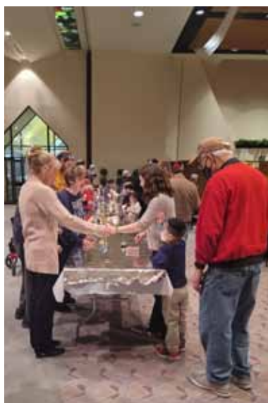
K.I. congregants lighting their own chanukiot