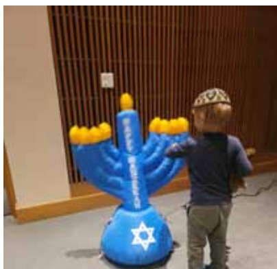
Ethan Toniazzo is fascinated with the blow up Chanukiah