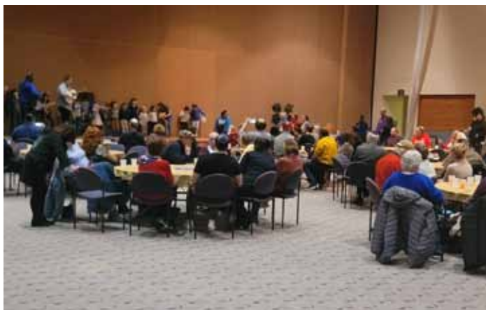
Being entertained by the children's choir