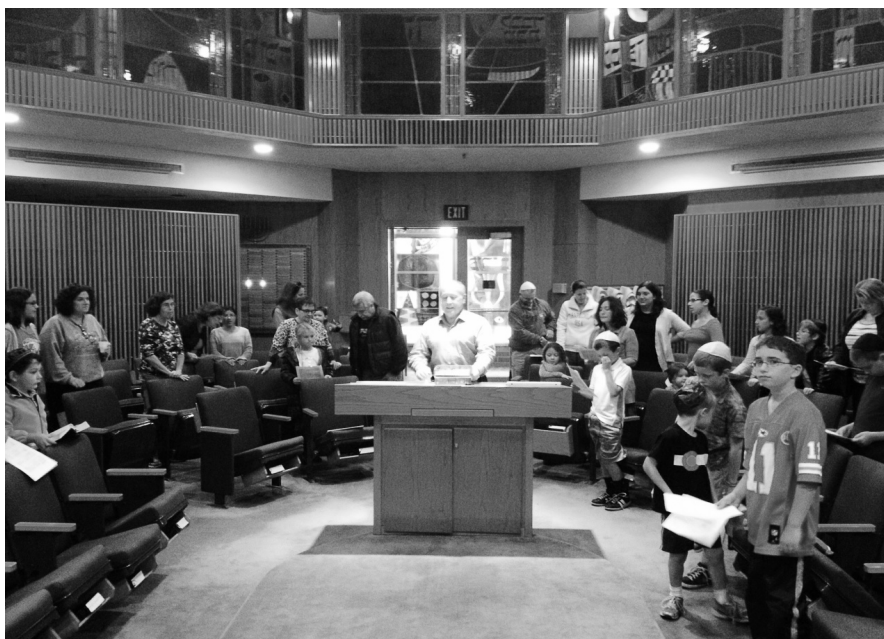
Sunday morning tefillah